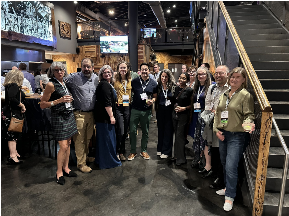
Johns Hopkins University (JHU) and the Center on Aging and Health (COAH) were well-represented at this year's Annual Meeting of the Gerontological Society of America (GSA) in Tampa, Florida. Faculty, fellows, and students from the Center, as